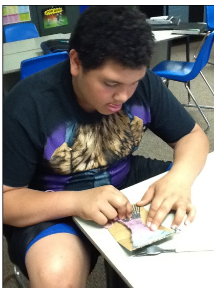
Weaving representing Venezuela