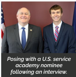
Posing with a U.S. service academy nominee following an interview.