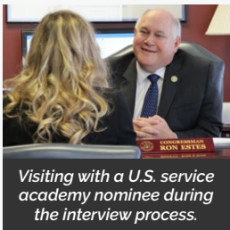
Visiting with a U.S. service academy nominee during the interview process.

Please give serious consideration to the reasons why you are interested in an Academy and a career as a military officer before applying.