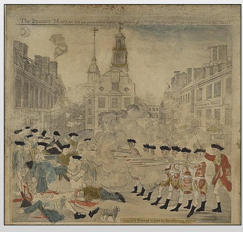
Paul Revere, March 28, 1770 The Bloody Massacre Perpetrated in King Street on March 5<sup>th</sup> 1770 by a party of the 29<sup>th</sup> Regiment