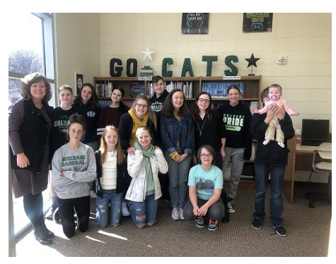
5th Hour Poetry Slam