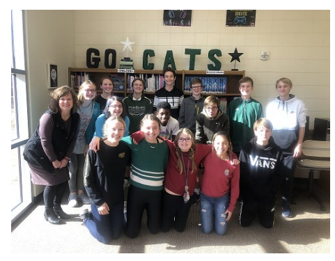
4th Hour Poetry Slam