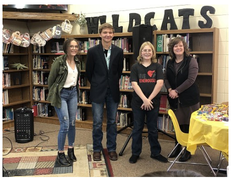
3rd Hour Poetry Slam Winners