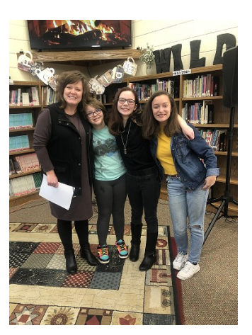
5th Hour Poetry Slam Winners