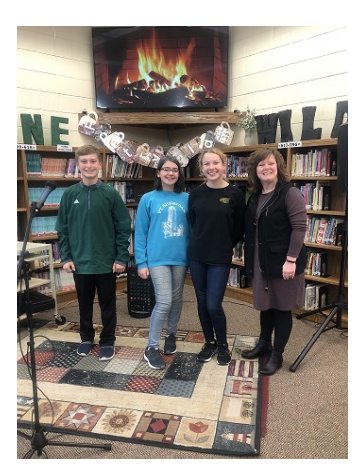
4th Hour Poetry Slam Winners